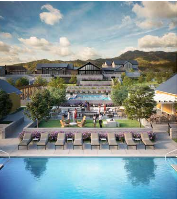
HIP AND CHIC: Nobu Hotel Los Cabos lobby entrance (top) and executive suite (middle), and Four Seasons Resort and Residences Napa Valley guestroom and exterior (bottom)