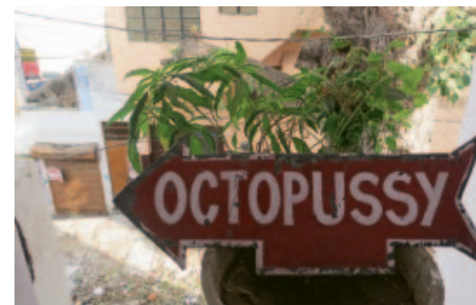
Udaipur still has many restaurants and guesthouses that show "Octopussy," the James Bond movie filmed there.