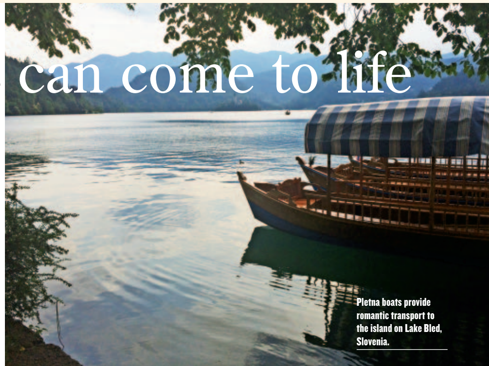
Pletna boats provide romantic transport to the island on Lake Bled, Slovenia.

the top of a grand flight of stairs has led to an entirely new wedding ritual.