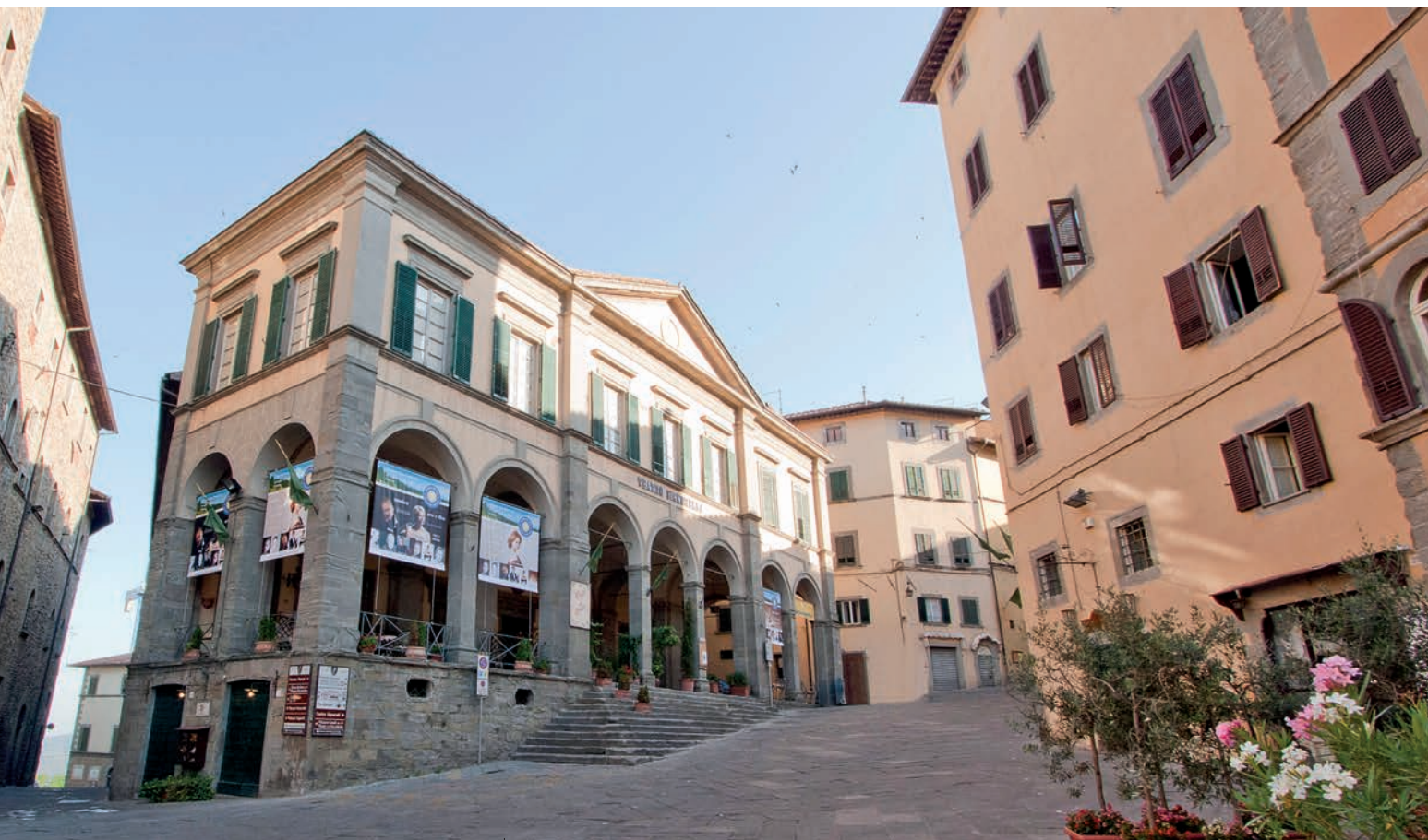
FROM TOP: Teatro Signorelli, Cortona's historic theatre; opening shot from Cortona On The Move, 2014.