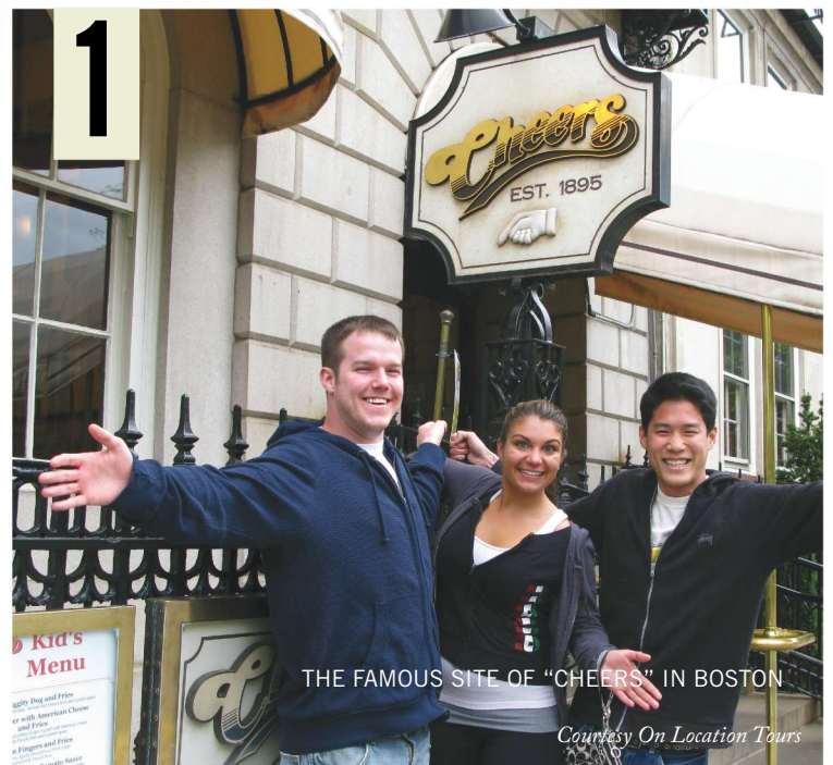
THE FAMOUS SITE OF “CHEERS” IN BOSTON